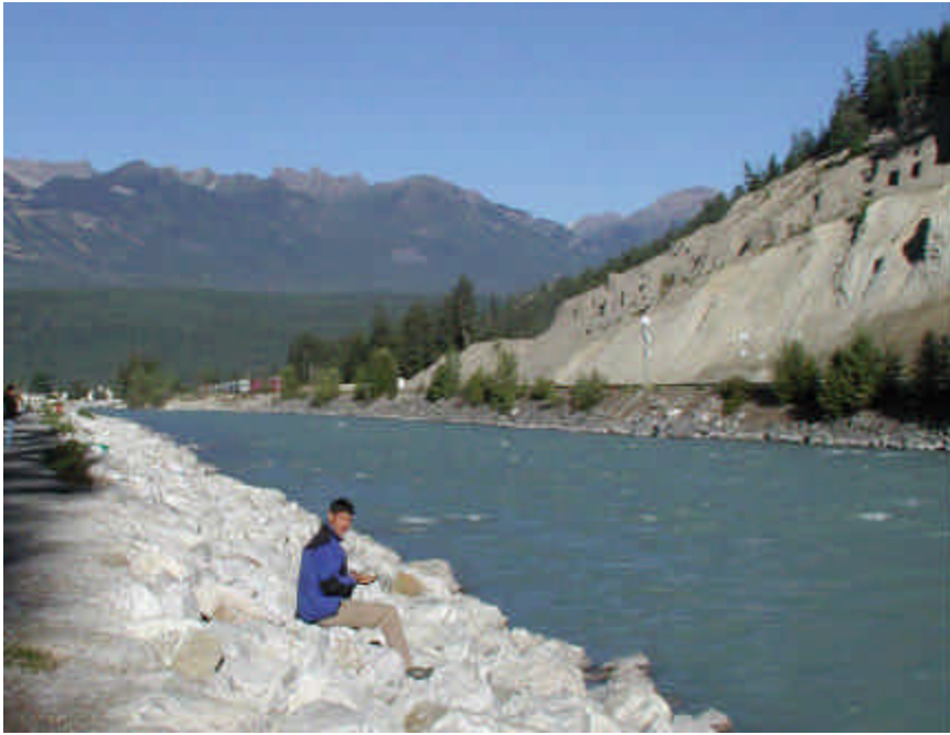
German cyclist in Golden

Saw Ken from Winnipeg once again B&B so light load D44.3 3h7 M53.6 A14.1 by lunch Tables beside Kicking horse river really nice for lunch. Can see pine beetle damaged trees