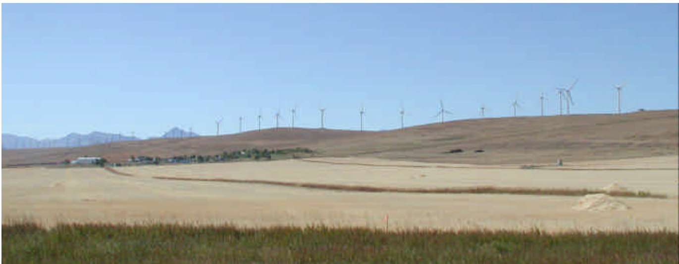
Windmill Farm @ Cowley Ridge The just seem to go on and on!

Accommodations: Lions CG Grass totally dead as no rain for 6 weeks and very hot. $5.00 Hot showers included plus a really nice enclosed shelter with power and a sink to wash dishes and picnic table inside.