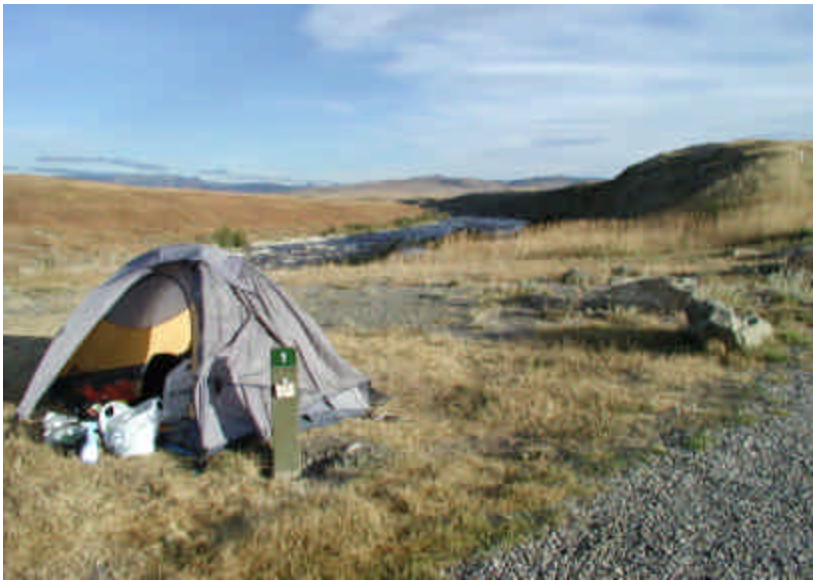
Maycroft CG on Oldman River