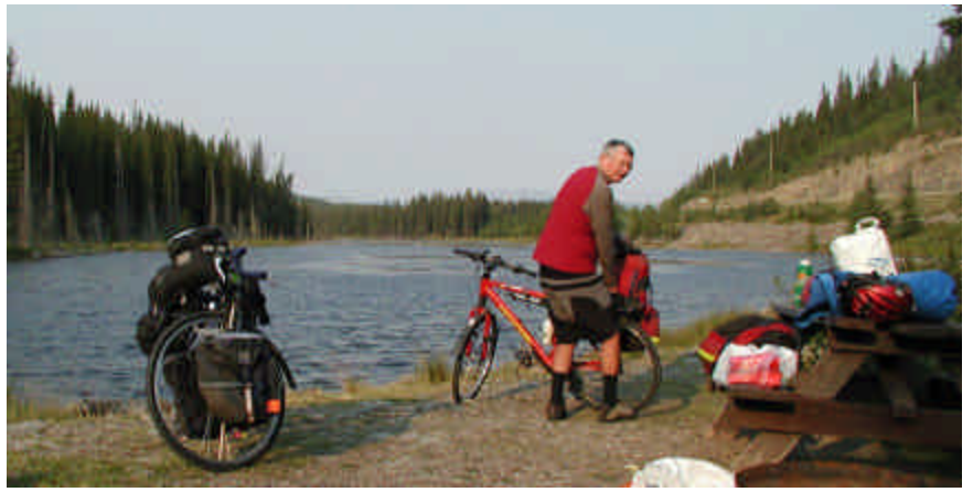
Camping on Beaver dam Creek