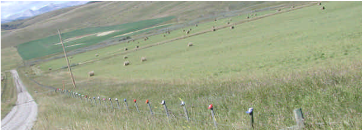
Hats on the fence posts for about 3 miles!