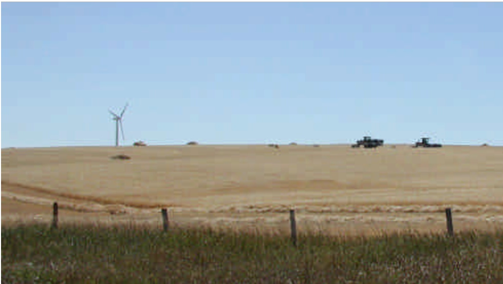
Harvest time: Wheat

Overall Good ride, but very hot come afternoon. Cooling off nicely tonight after the sun down. Went to Remington Carriage Museum. Really neat to look at the old buggys. Well worth the $9 per adult. Wheat fields being harvested all along the way. Saw a Combine crew of about 6 combines moving rapidly thru the field to get done in a hurry. I think they must have huge ranches here as the homes are few and far between.