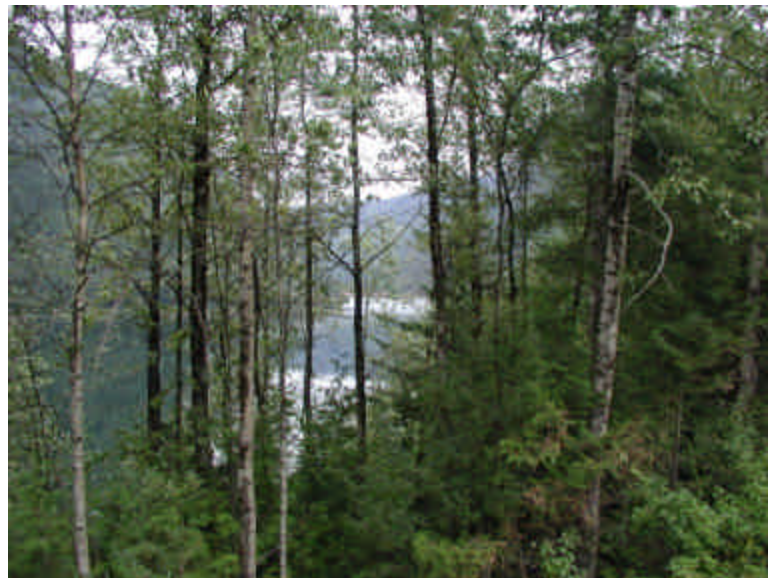
View towards 3 Valley Gap Hotel

Accommodations: CG showers used swim pools Trees nice nothing special Quiet Way way over priced and they refused to let our German friend stay on our site... one tent per site yet huge buses pulling boats same price. Rip off! $30 for a site and only one tent per site even if a pup tent.