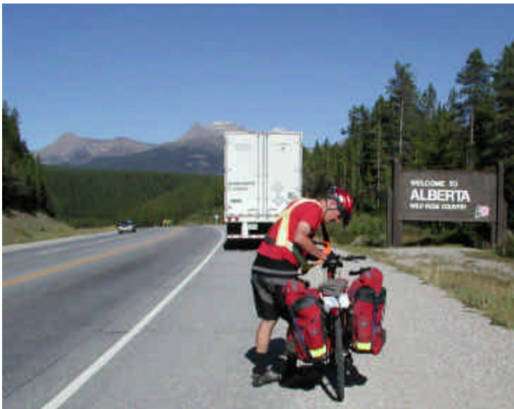
Crossing the Alberta Border