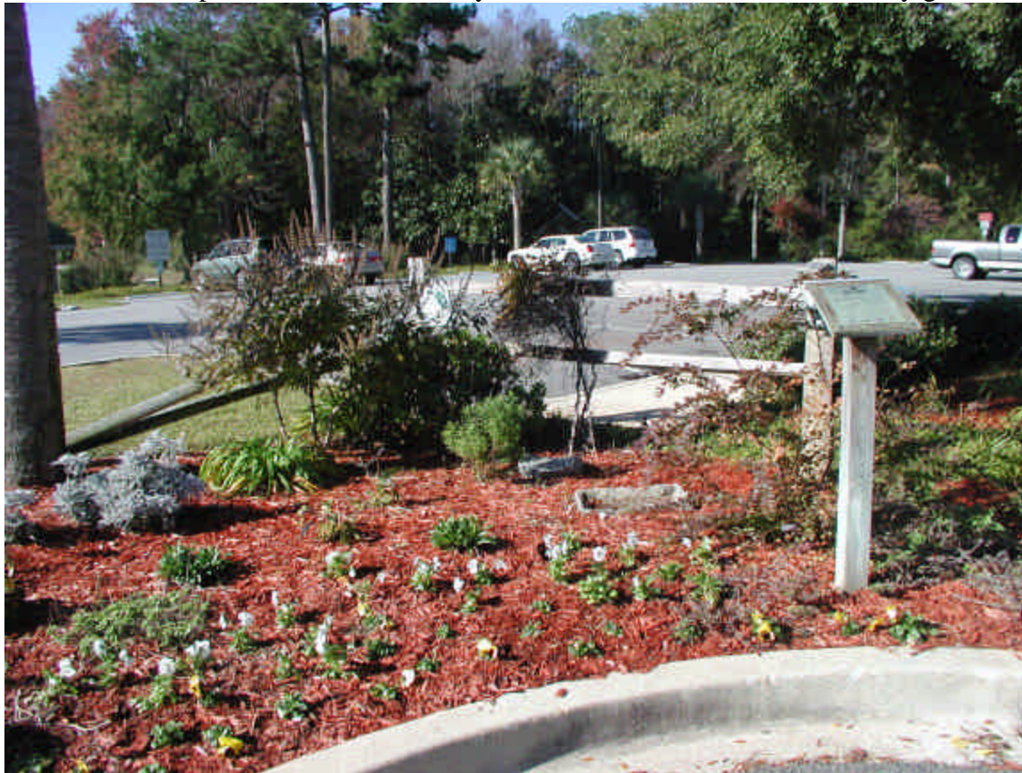
Carolina Fence Garden

We have seen other Blue Star Highways in other states. They really support their troops more than we do. There are lots of palm trees down this way, but none of them seem to be in very good shape.