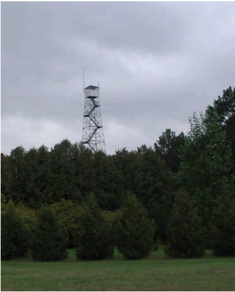
Tree farm and fire lookout corner hwy 87/64