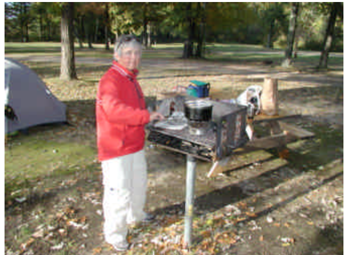
Hurry the smoke is in my eyes!