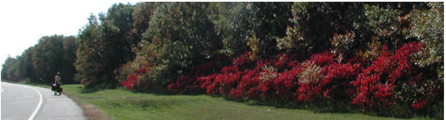
Awsome Fall colors