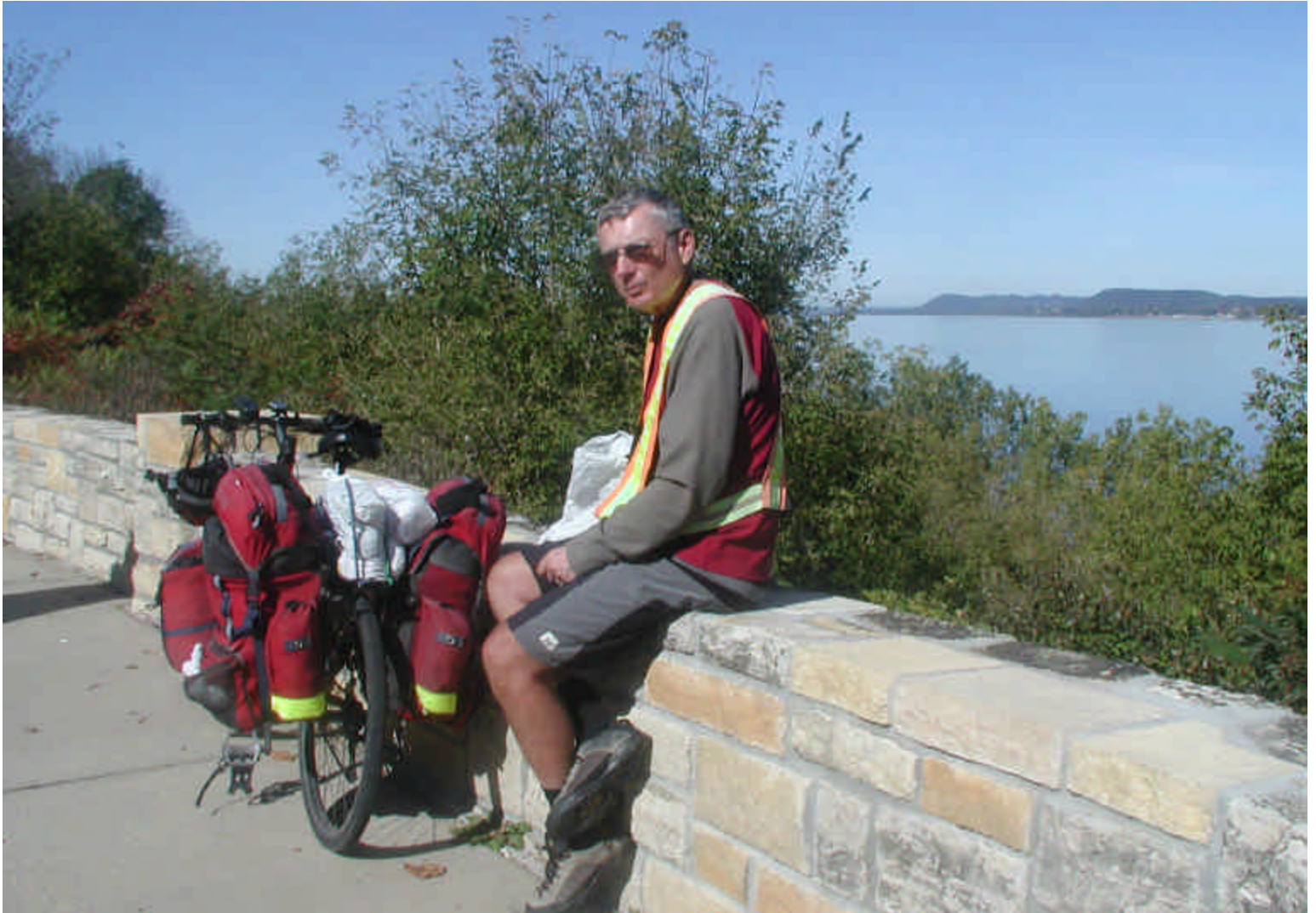
Having a rest along the way