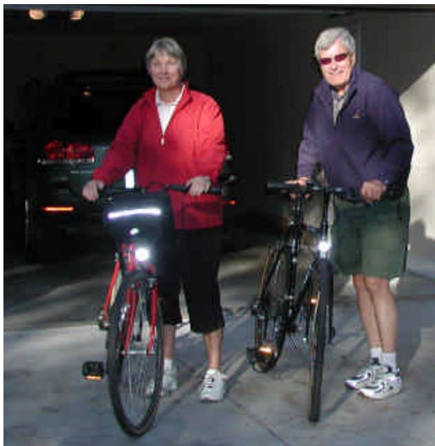
Looking pretty good for "65" !