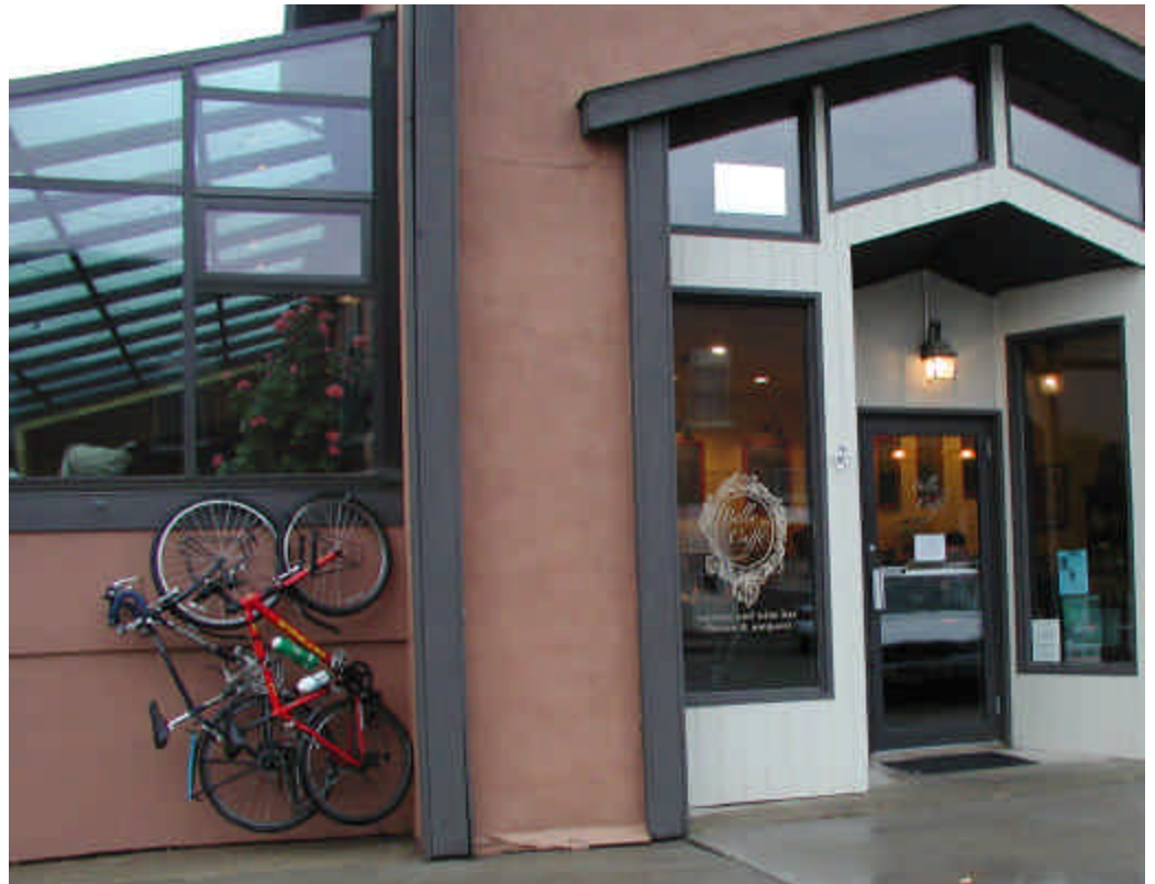
Bike parking at the Bella Caffe'