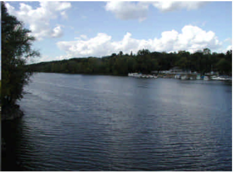
Wisconsin channel separated by small island