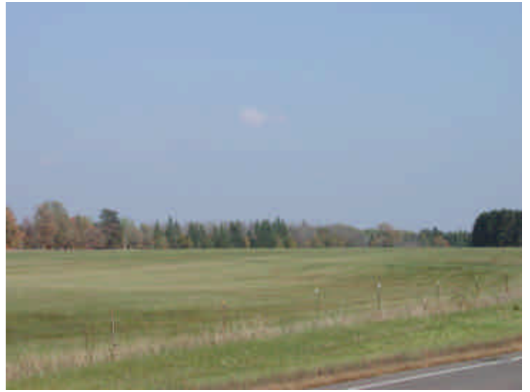
almost Prairie's of Minnisoda