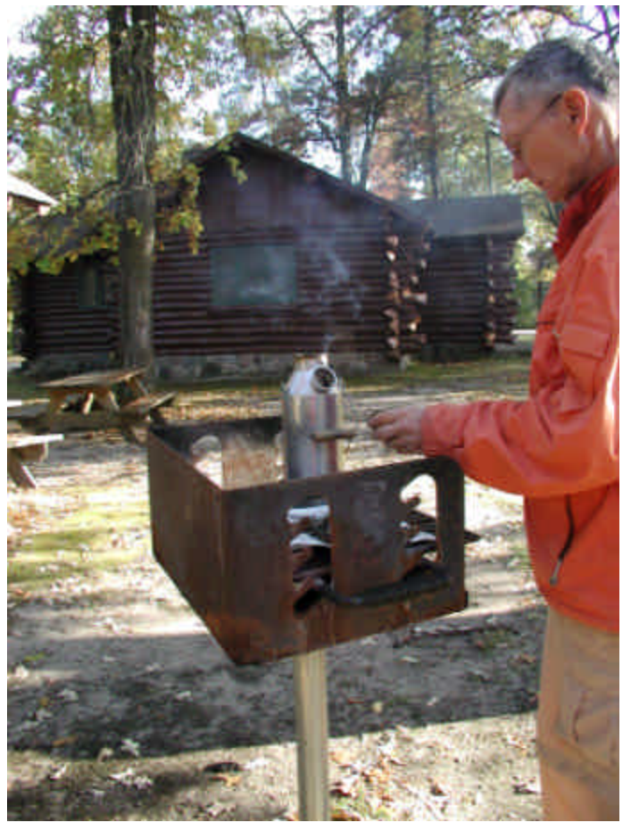
Cooks making supper