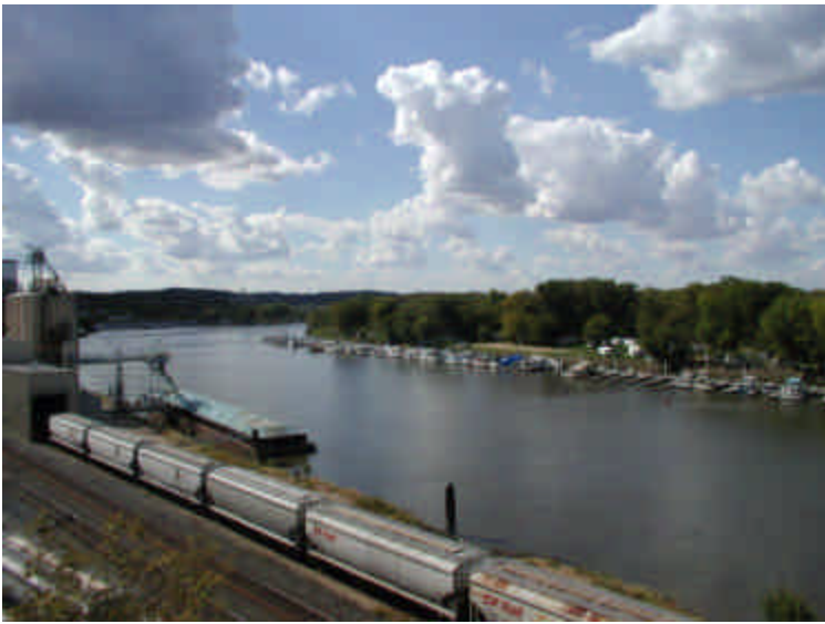
Minnisoda channel of the Mississippi River