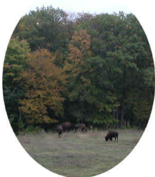
Buffallo in the Wildlife preserve