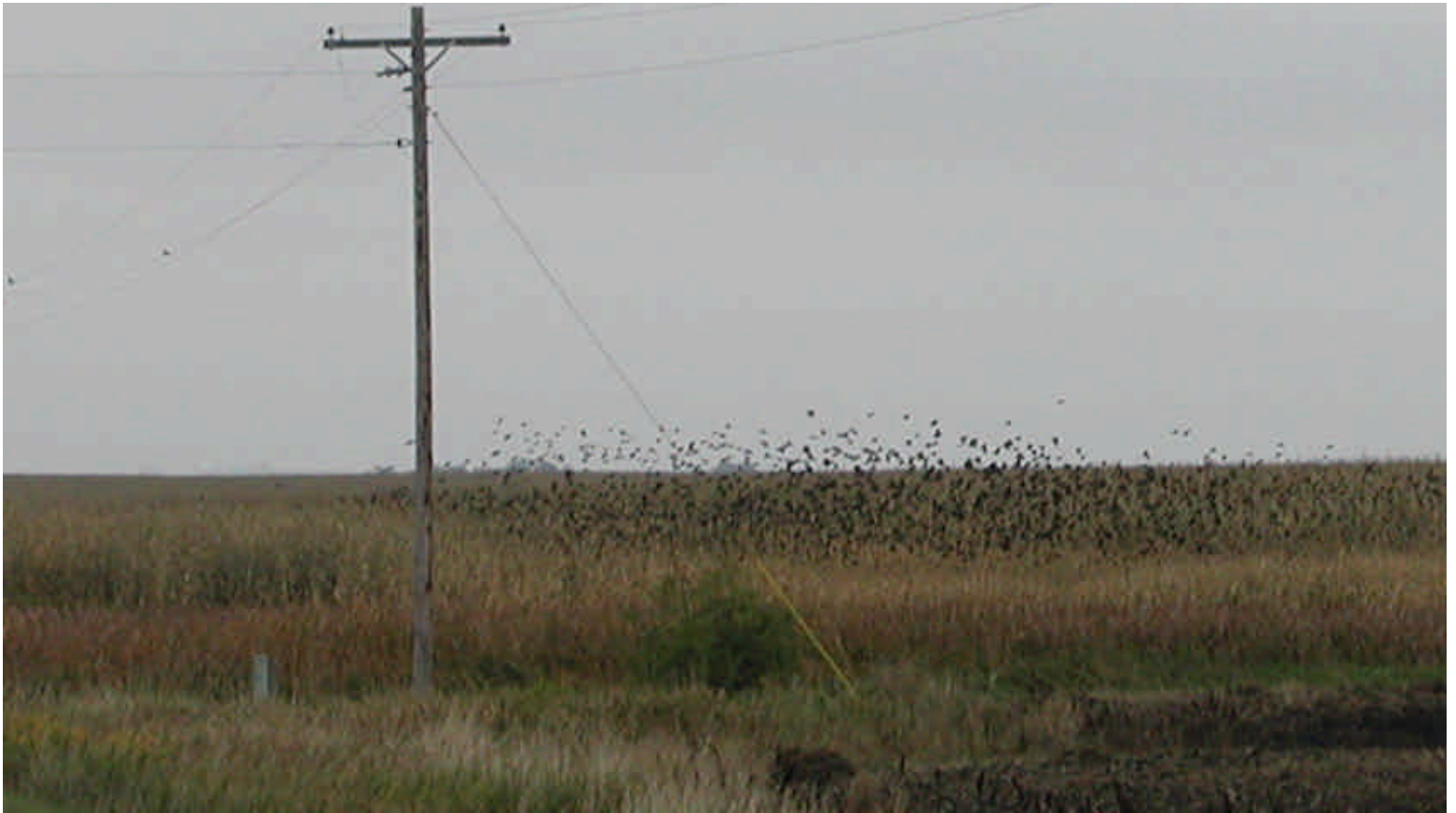
Birds ravaging the corn fields