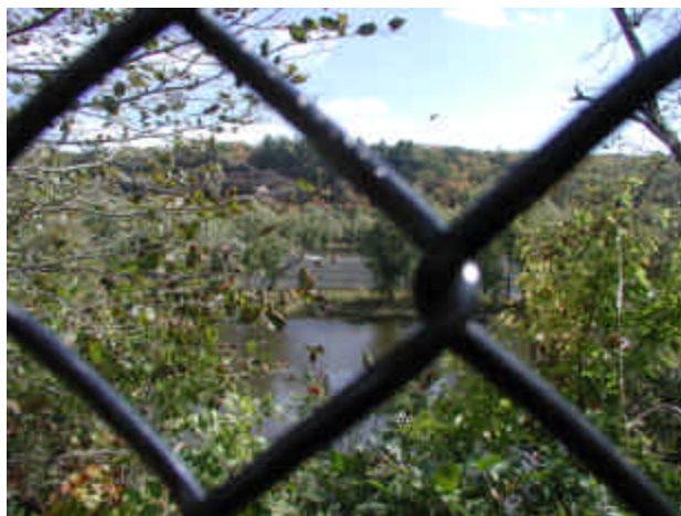
Peek at the Great River Mississippi at a rest stop

77.7 Arrive Lake Pepin CG which is a RV pk on the hiway