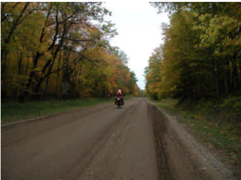
Thru the Wildlife Preserve... Gravel!

Left on 34 to Park Rapids [AS] Piney Park CG is south on hwy 71 4.5k on left side of road