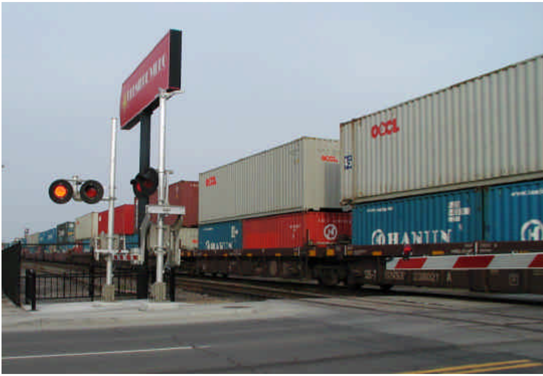
Trains in Fargo