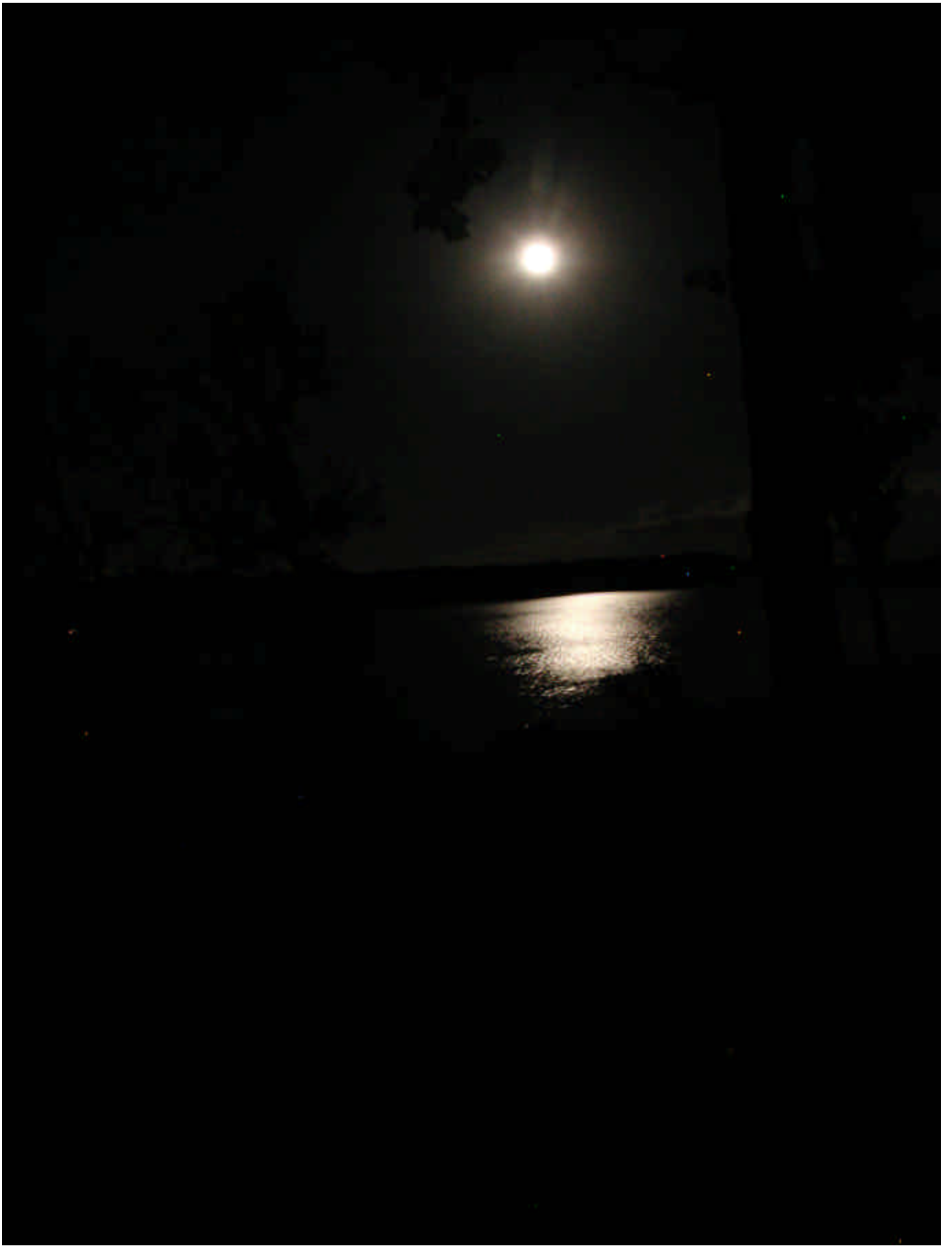
Full Moon lite night