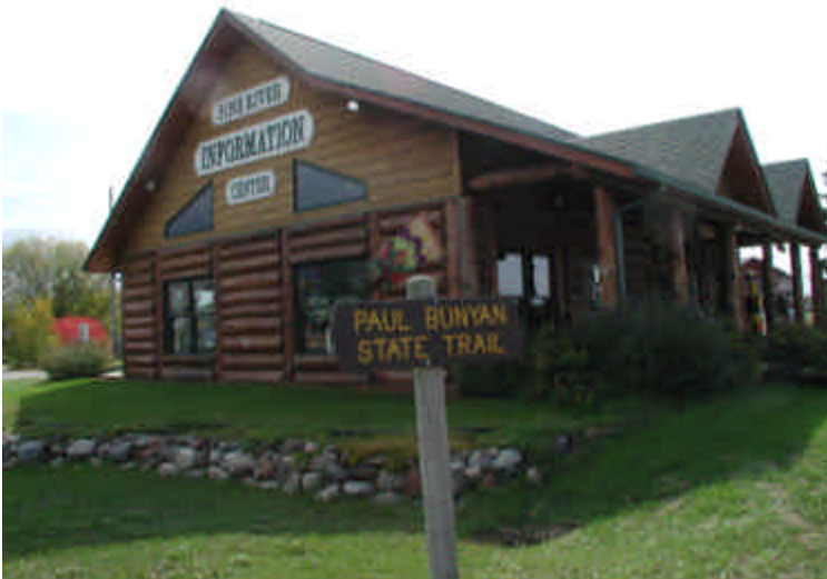
Beautiful Info Center in Pine River