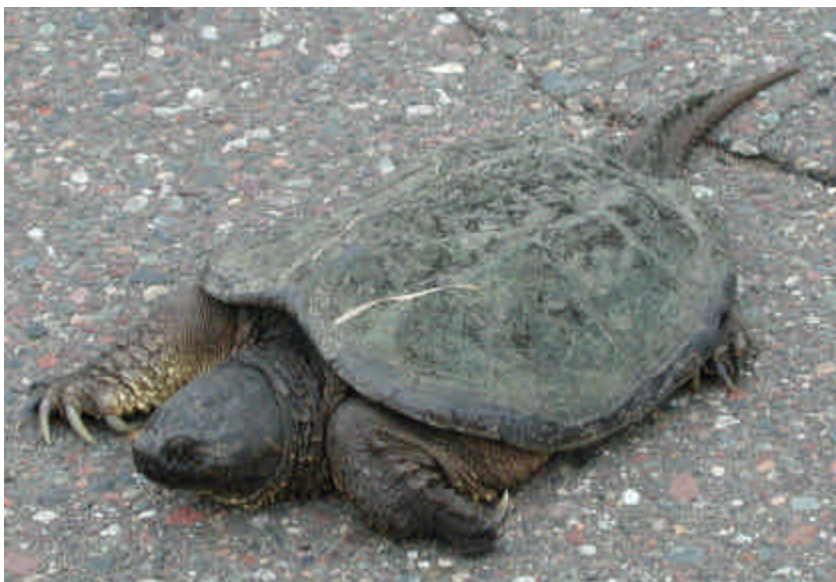
See those Fingernails!