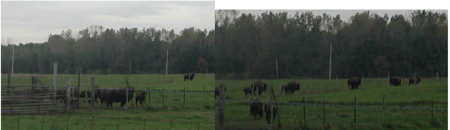
Buffalo Ranch just outside Buffalo, Indiana

Oct12 Friday D137.54km M 42.6 A 17.7 T7h 44 AT9 h total 5201.8 km