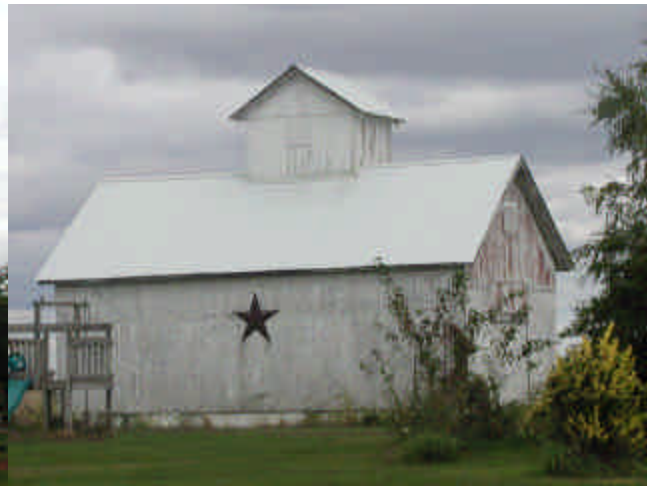
Amish Barn Stars Good luck like horse shoes. Originally made by the Amish, but a “décor” item now.