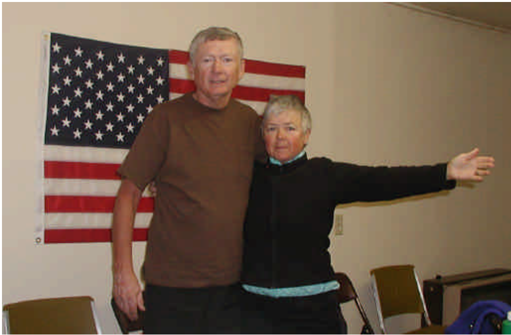
Inside at the Iroquois Town Hall. Who is that young man I am traveling with?