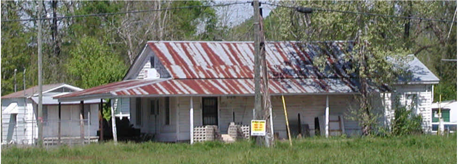
This is very typical of the housing we have seen, most of it in more disrepair than this one.