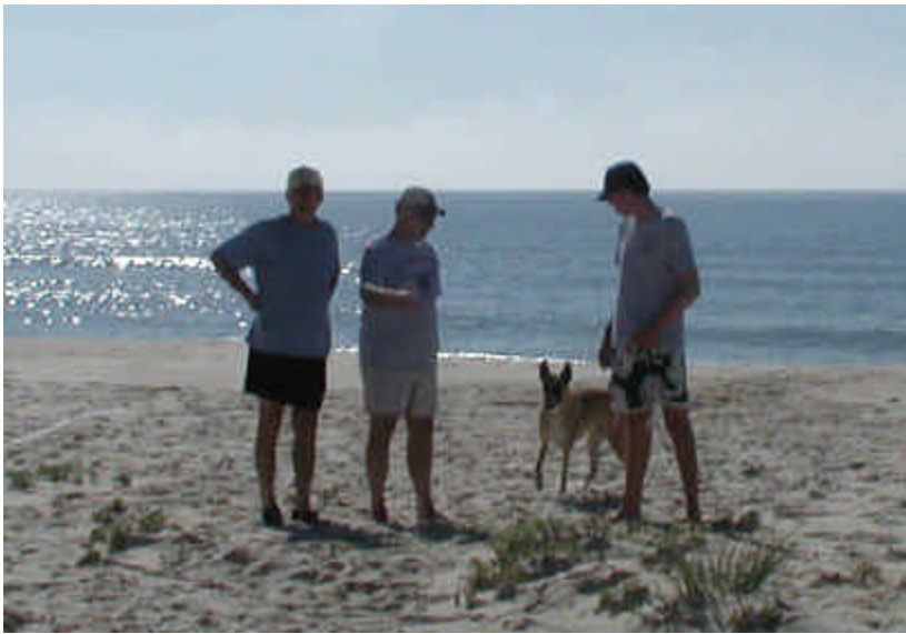
Boys on the beach