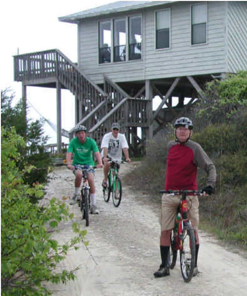
Boys going for a cycle