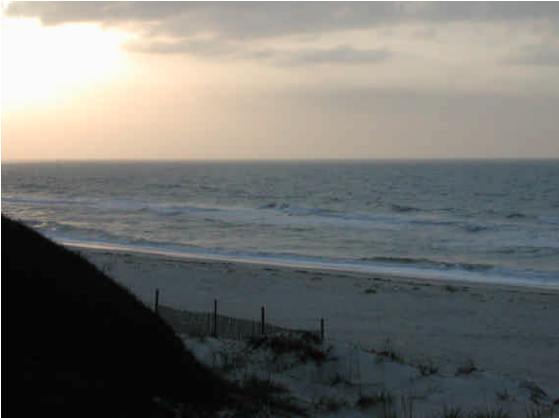
Baldino's view !