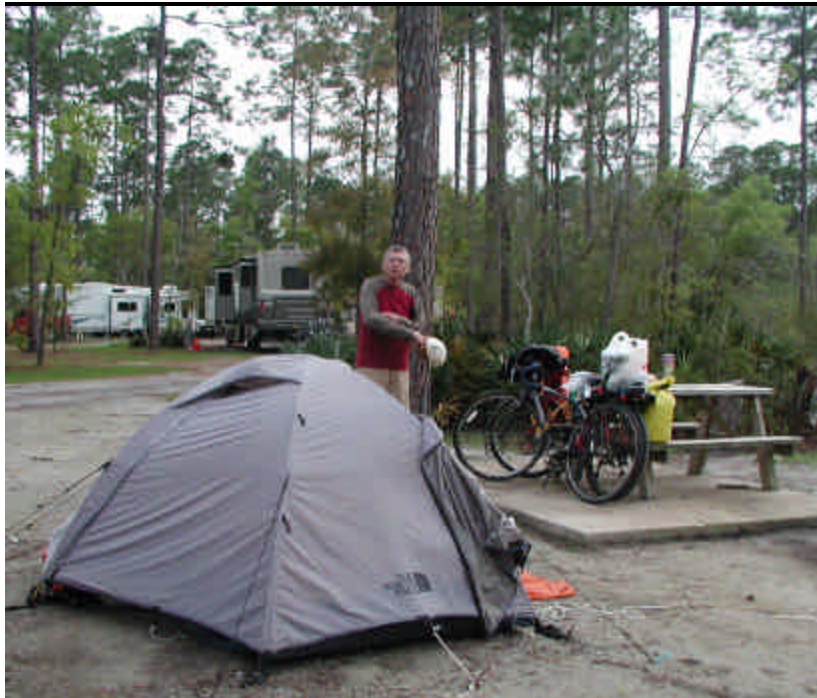
Peach Creek Camp site