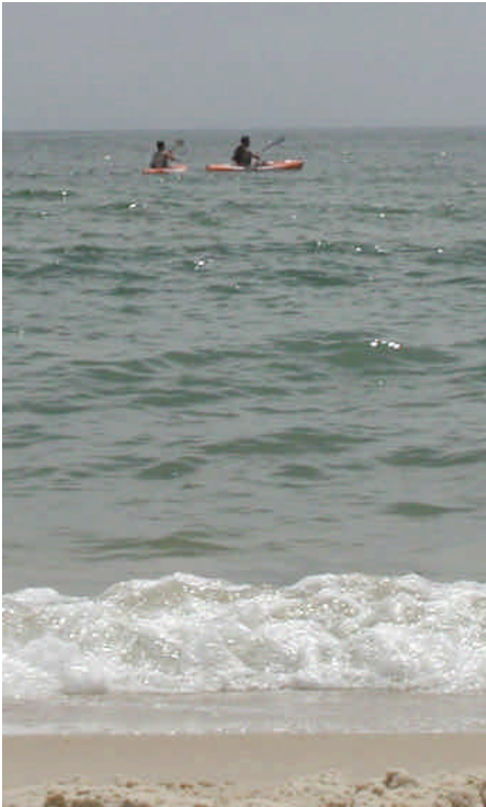
Kayaking at St George's Island