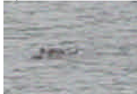
Peaking Alligator !

don't come up into the campsites.... Or so we think they don't!