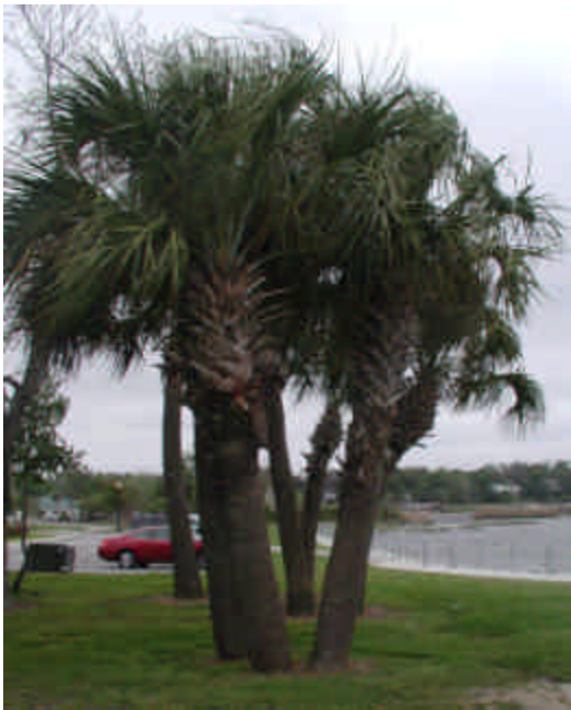
Palm Trees everywhere