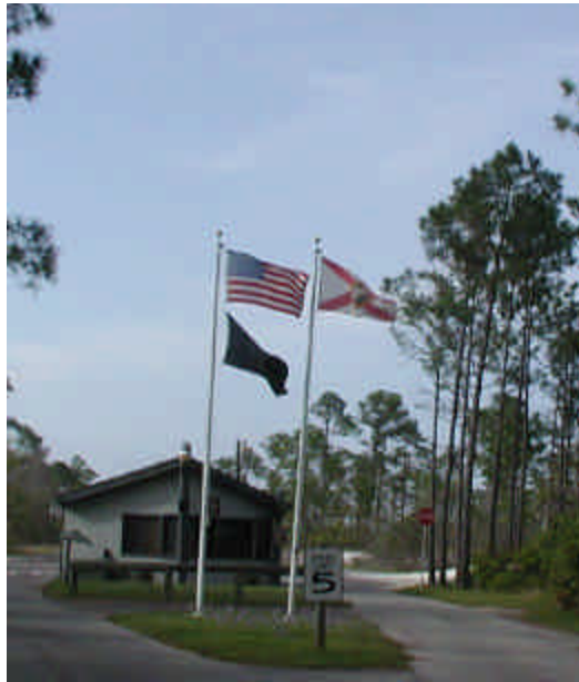
Entrance to State Pk ? flags Ken setting up our site