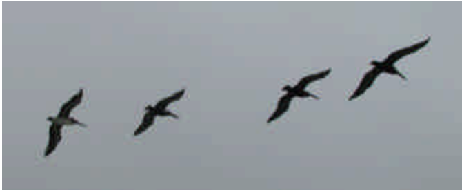
Pelican fly by

D 21.24k M 25.1 A 14.5 T 1h27 total 21.24 km start to trip