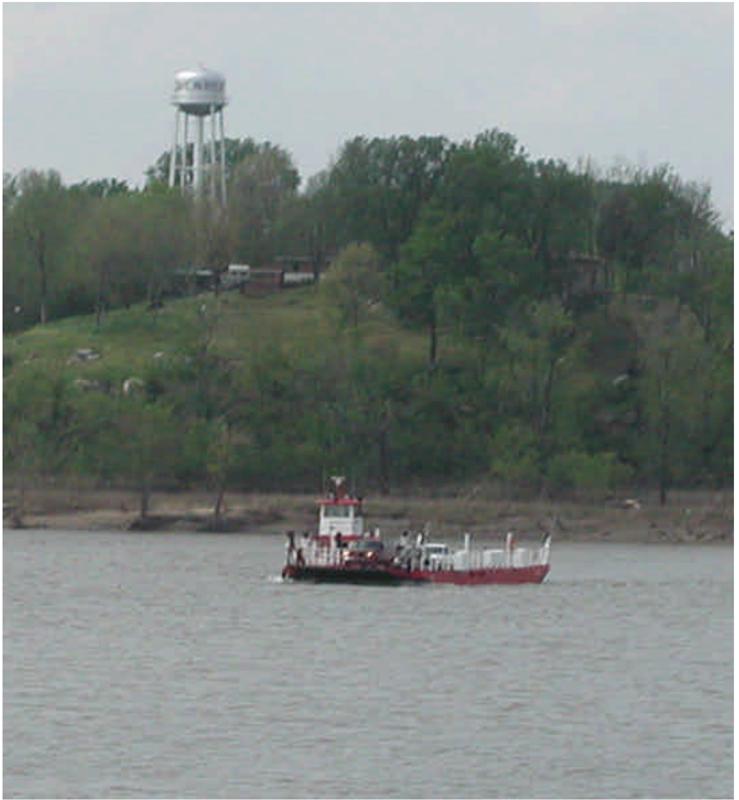
Not much of a ferry