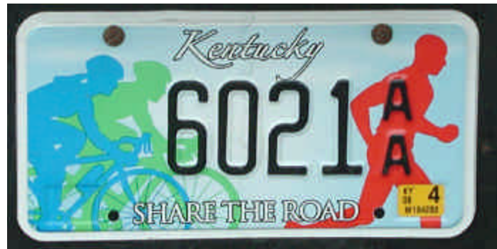
Love this license plate!