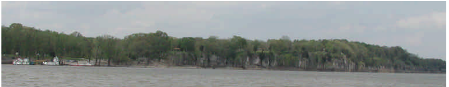
Going over the river to Grand Rivers Over the Ohio River looking at the Cave and Rock area