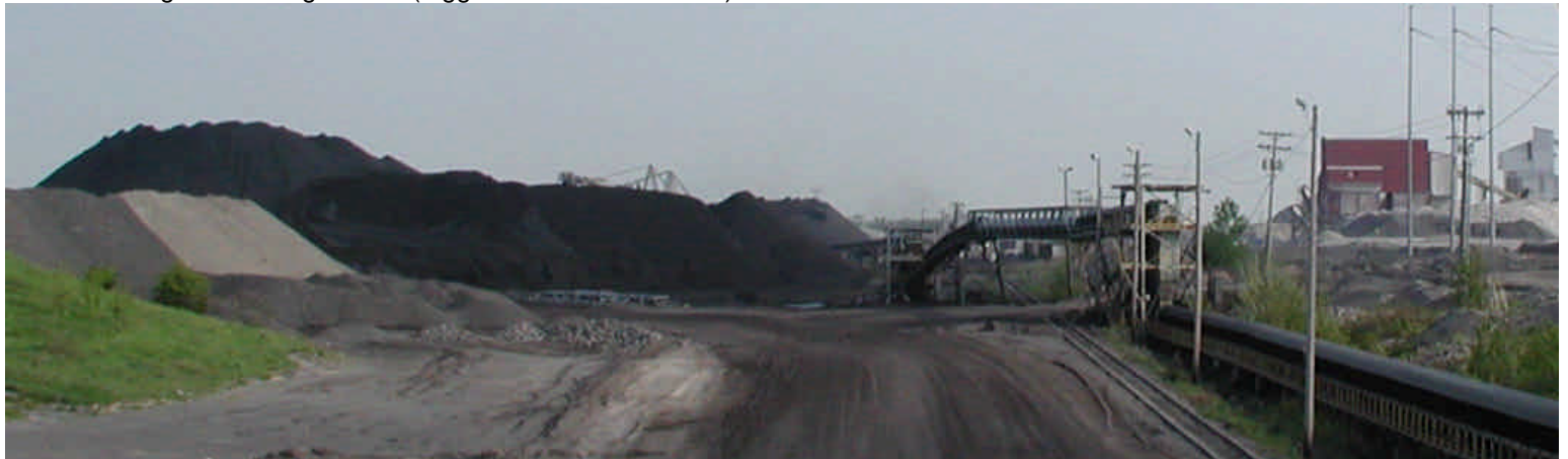
Surface Coal mining is one big industry here.

Smithland might be best groceries(bigger than Cave In Rock) also has a Dollar General