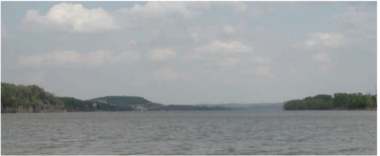
View down the Ohio River