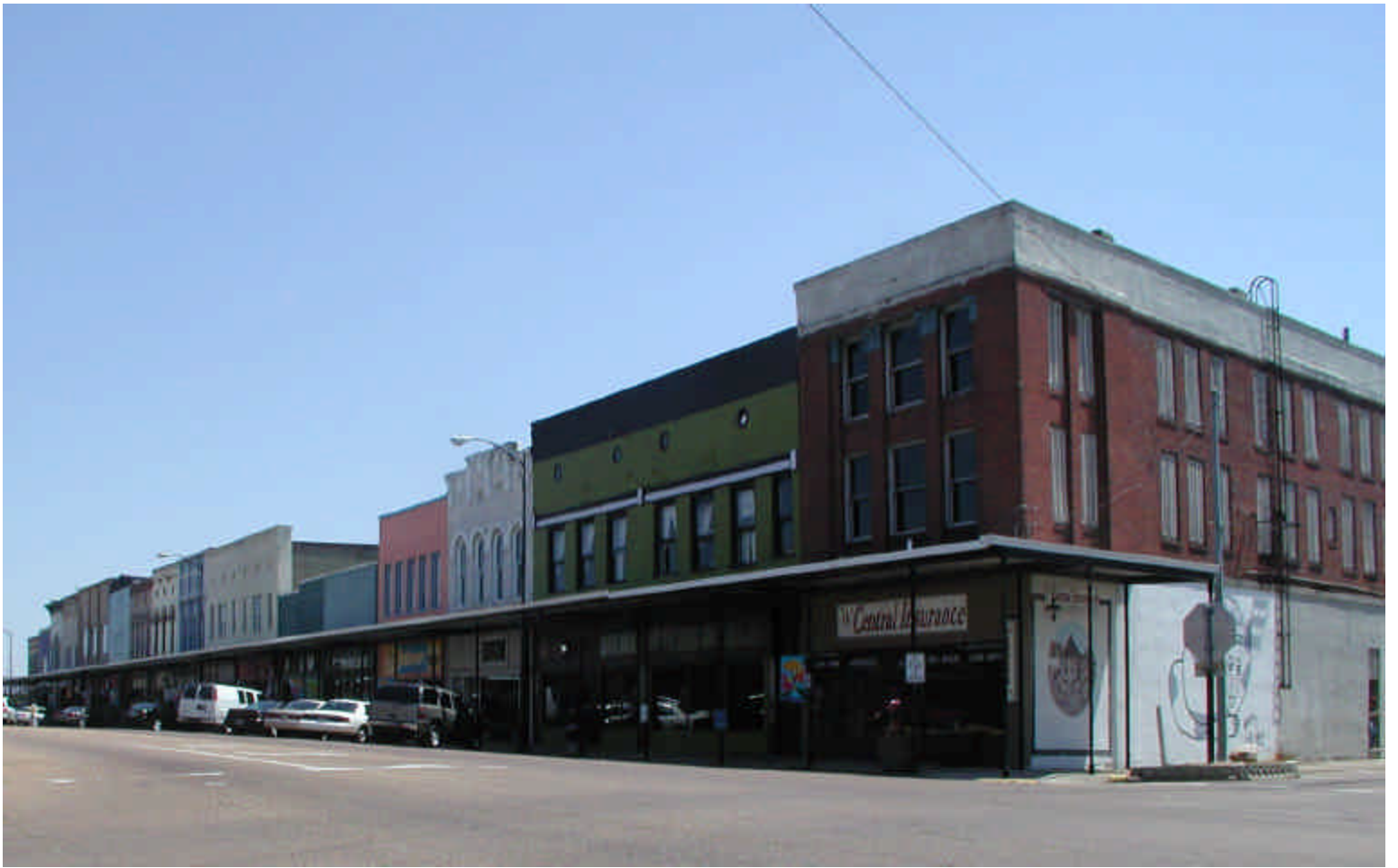
Aberdeen main street