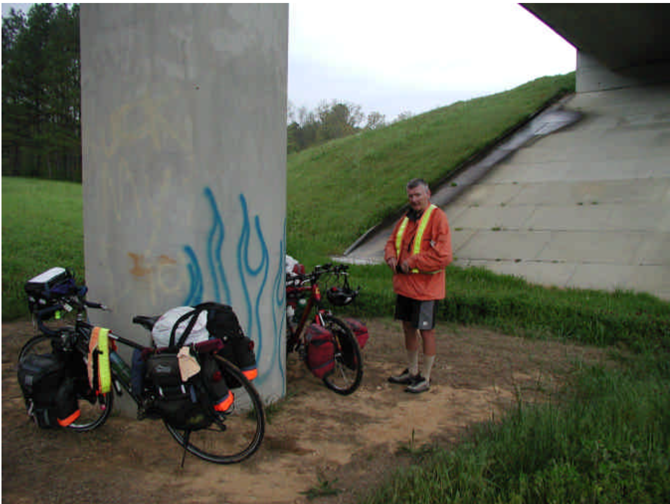
Hiding from the rain