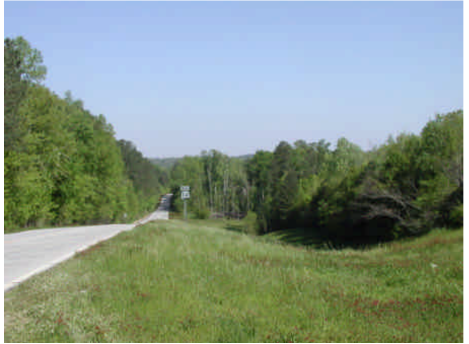
Hills and more hills.... And bush!