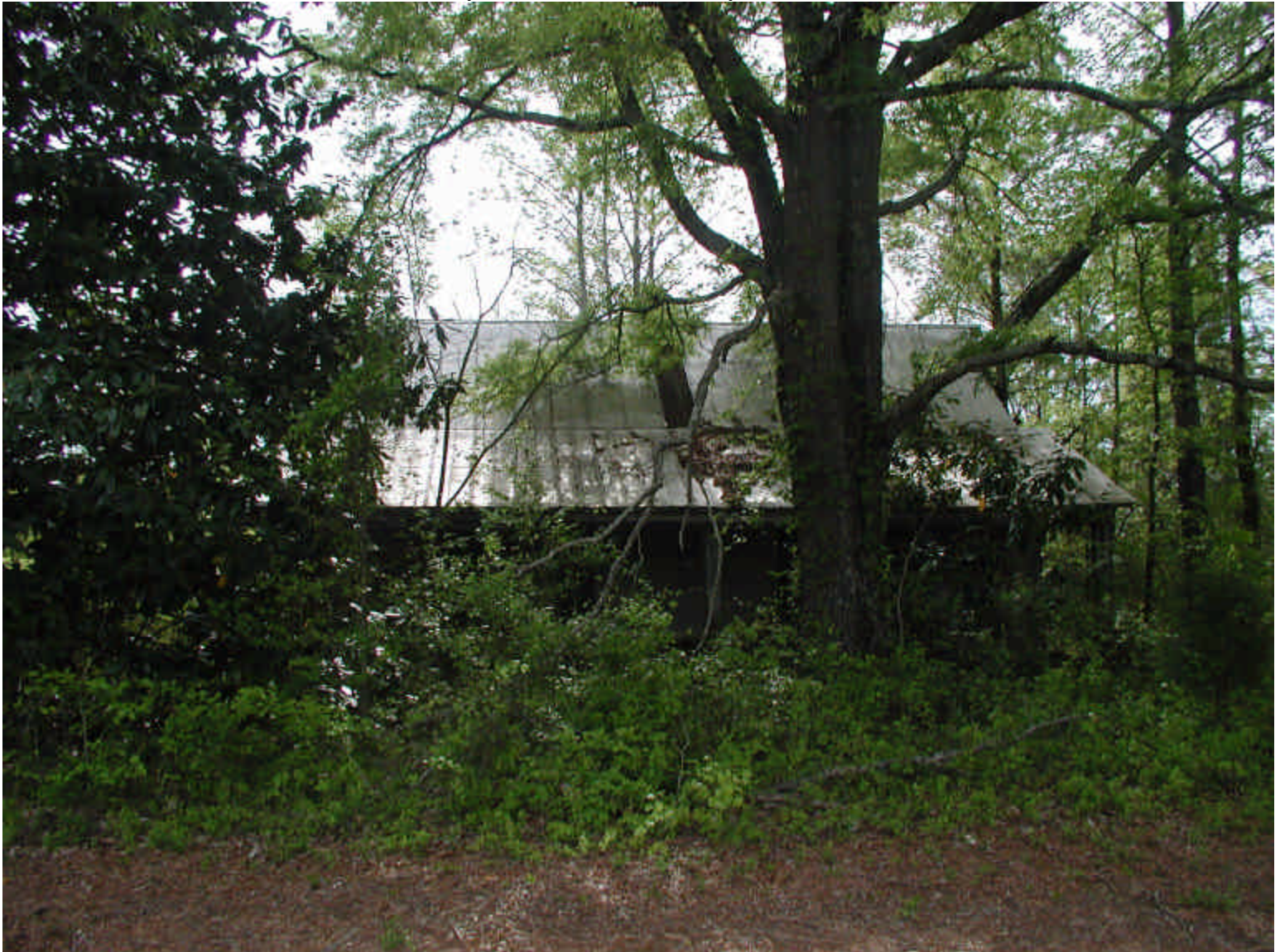
Homes in the woods

Tishomingo State Park (662) 438-6914 105 County Road 90, Tishomingo, MS 38873 Smithville has a Piggly Wiggly 2km south on 25 Fulton has a Piggly Wiggly on route If needed hotel take 178 east out of Fulton to 25 South to Belmont Belmont Hotel (662) 454-7948 121 Main St, Belmont, MS 38827 This would shorten day 15, and add 7km to Day 16