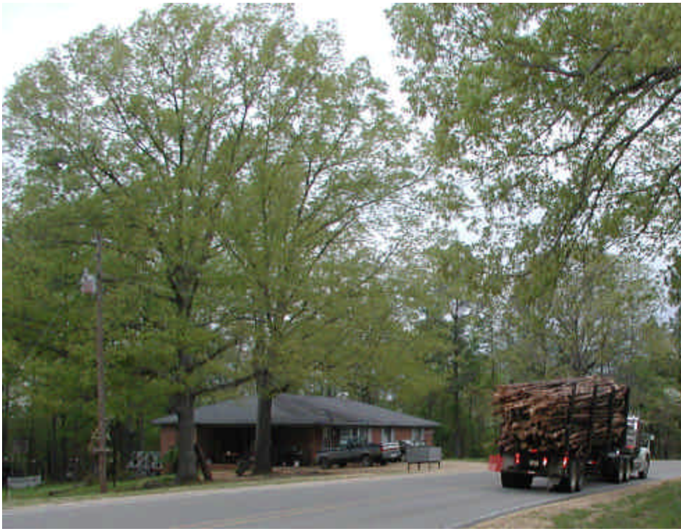
Loggers on the shoulderless road