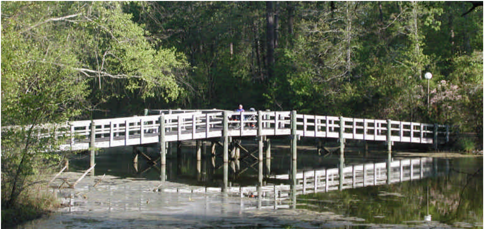
Enjoying the morning sunshine on the foot bridge over to our camp spot