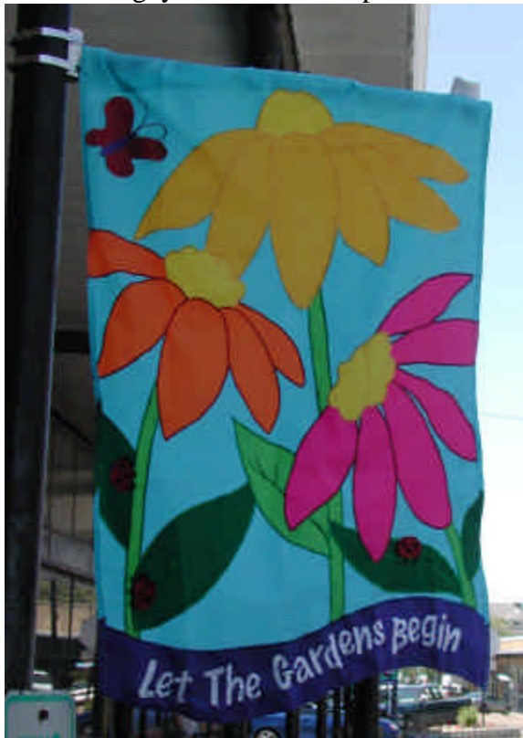
Aberdeen banners so cute with 3D Lady bugs