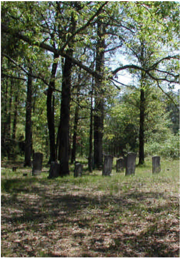
Family graveyards just along the way