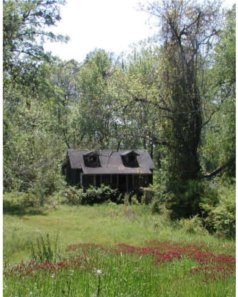
I love these houses tucked in the trees.

one is across the road from us with a table and all... oh well we are very glad to have the light and power Overall Good day, both very tired.