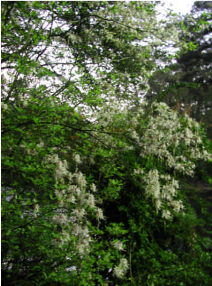
wild flowers in campsite