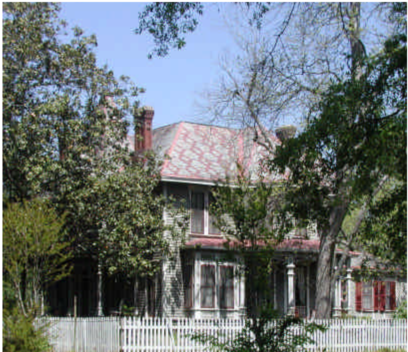
look at the ornate shingling pattern... flowers on the roof!