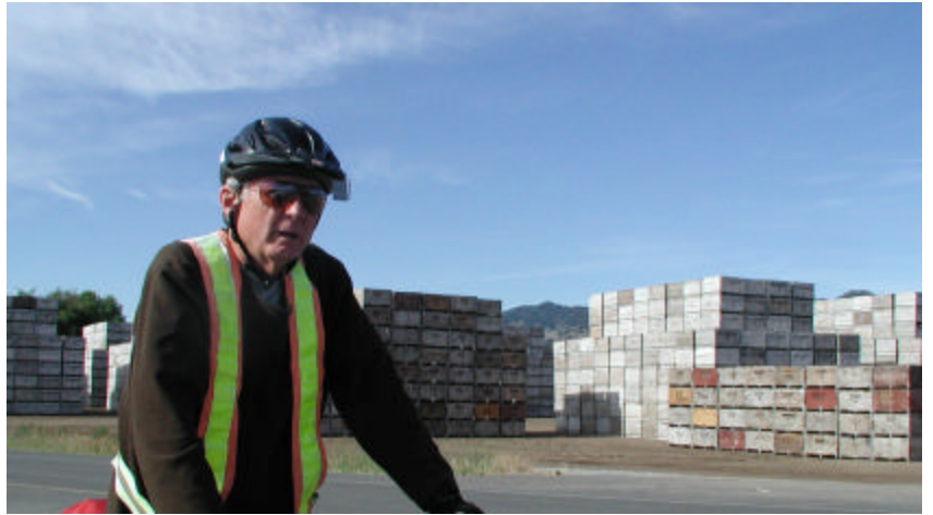
Apple boxes awaiting the crop in Osoyoos