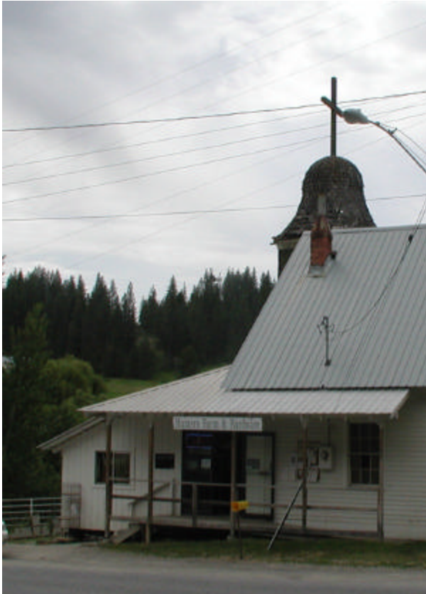
Catholic church now a hardware store.