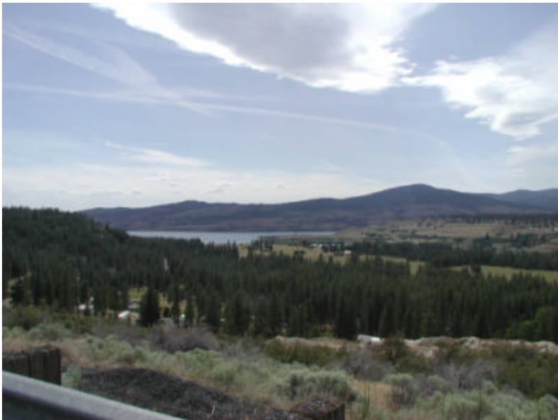
first views of Lake Roosevelt

Group of Russian speaking youth 2 down were a bit rambunctious. 2 guys across stayed up most of the night partying, but didn't disturb me!