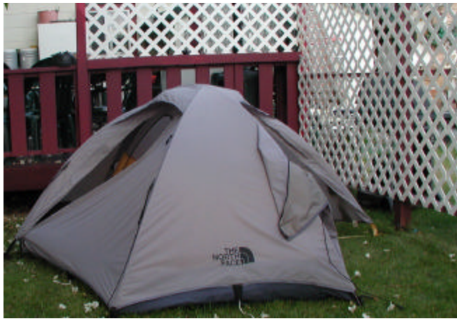
Tent in the sprinkler zone

Also:Visitors Information Ctr Rv (509) 486-4429 7 N Western Ave, Tonasket, WA 98855 Red Apple Inns 20 S Whitcomb Ave Tonasket, WA 98855 (509) 486-2119 There is Grants Family foods on side street