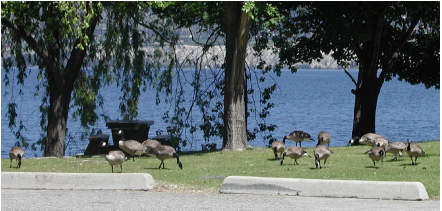
The Canada geese beat us home!

Did a weight in on return home... I was carrying 61 lbs of gear + bike and my 110 lb frame..... Ken is back down to less than 157 lbs... as seen here we had a good laugh trying on the wedding suit!