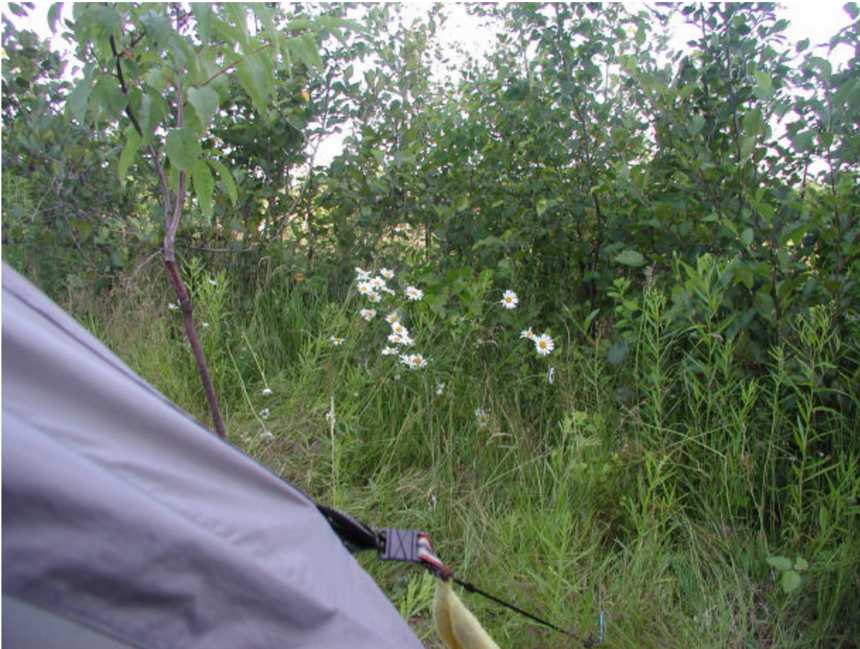
Wild flowers beside our ditch campsite!

What a day! We awoke several times in the night to the snoring in the tent about 25 feet away in the next campsite... now that's a loud snorer! Anyways we payed them back by packing up just after 7am and heading off. We had a lot of more rolling up and down and made good time to Charlottetown {36km 49.9/14.4 2h 29} Had great home made veggie burgers at a Bakery /café just 0.5 off the hiway that is out of the Terra Nova National Park. This park is known for it's Moose, but we didn't see one! The call them Newfoundland speed bumps as so many are hit every year. After lunch I think we were sluggish and missed the Newmans sound CG which was at 48km and then the Malady Head was off the hiway so we headed on to see if we could make Gambo at 90km... didn't happen as the hills and heat got to me... we ended up just off the road at what looks like an old truck stop... we offered a free campspot at the park gate where there is a Putt and Splash [minigolf and water slides], but was a little too wally world for us. We are tucked into a grove of trees with wild flowers... the road is a little noisy, but will quite down at night fall, probably end up with a truck or two out in the parking area. We decided we must be out of shape as if we had 100km days planned there is no way they would be accomplished. Maybe by next week!