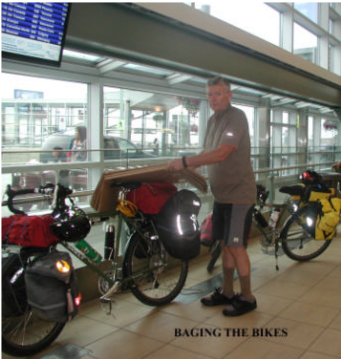
Prepping the bikes for travel.