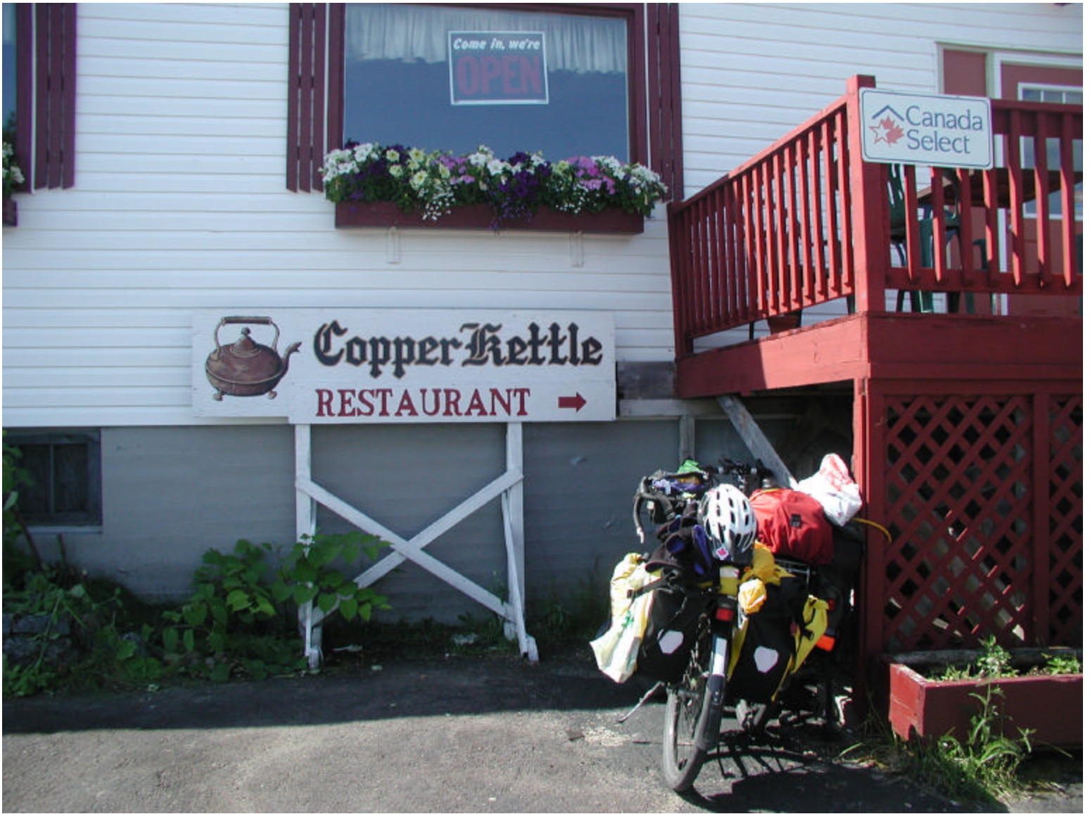
Cute sign for a tasty restaurant with white table cloths 24 x 7