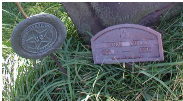
Revolutionary War Veteran

Set off from the hotel after waffle breakfast at 5C !!! and the sun had been up for a couple of hours! Fall is in the air! Our destination today was to go to the Old Dutch Church and cemetery at Sleepy Hollow where Isaac Yerex's father is supposedly buried. The route we took was on hwy 22 again for short ride and 120 to Bear Ridge [Hill] then Broadway to Bedford to Sleepy Hollow.... Not a flat country, but not too far.