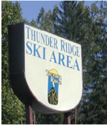
Another Ski Hill