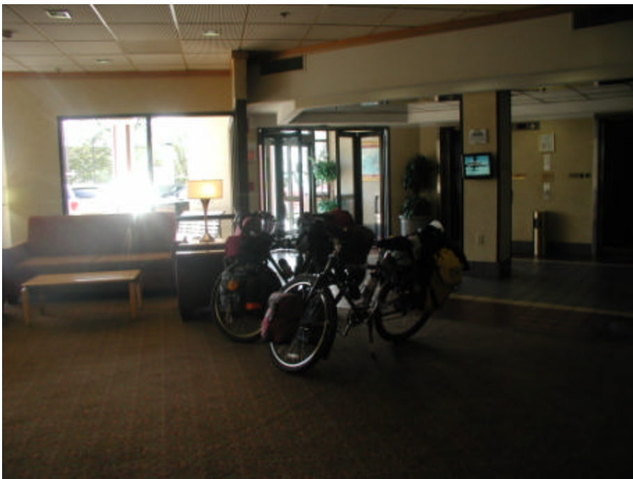
Finally the Days Inn Newark

Anyways will take tomorrow off really and not even go into NY... just vegg.... Catch up on the news and then Wednesday take a bus or train in for a wander around if we can find the way.