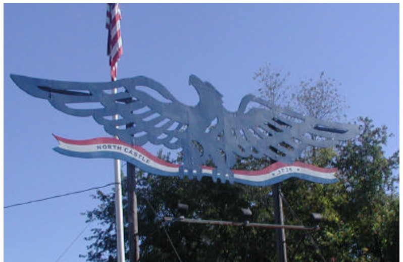
Proof that there is North Castle Town since 1736