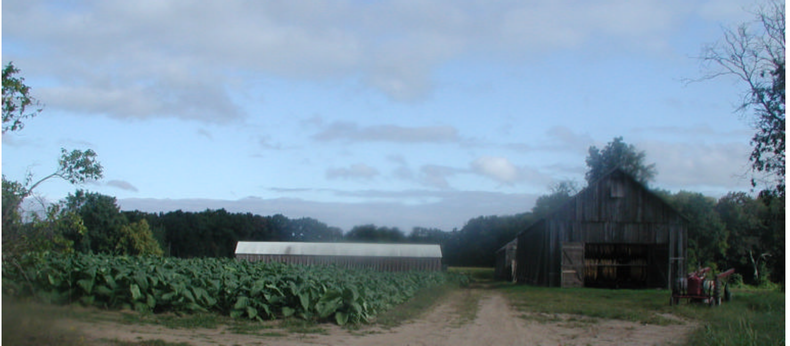
Tobacco field with drying tobacco in a interesting shed that every second board opens up for air.

Anyways tried to help her to no avail so we headed off [5C = 40F] to Ellington and East Windsor. Usual pancake stop and off again warming up rapidly to 20C. Was a great ride thru fields of corn, tobacco, veggies... mostly flattish valley to Granby then the hills started. It was cloudy most of the day and we thought we could go to a motel, but none on our route... tried to phone the Country 44 Motel by Pleasant Valley, but no answer... up up up out of Granby to 219 then a awesome down down down into Pleasant Valley. The day was long mostly because we stopped for almost 2 hours in Granby and lucky thing as we found out no groceries in Pleasant Valley, so shopped for food and were off.