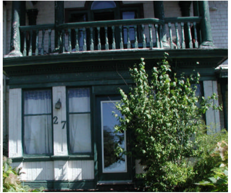
Beaton House (1907), 27 Granville St.