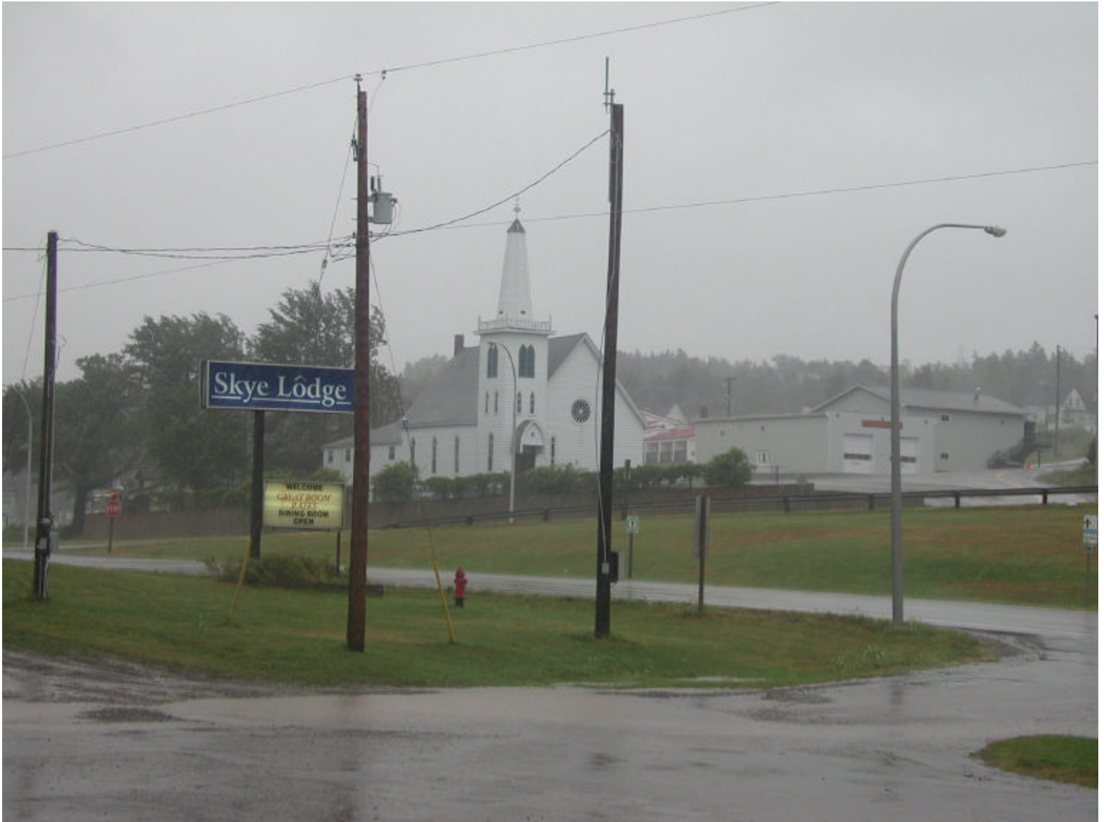
Trees blowing and rain coming down during the storm last night: Hurricane BILL

D53.25 k[55.21 tp cg] A16.3 M 50.1 PT 2h15 AT3h OD 2424.7 km