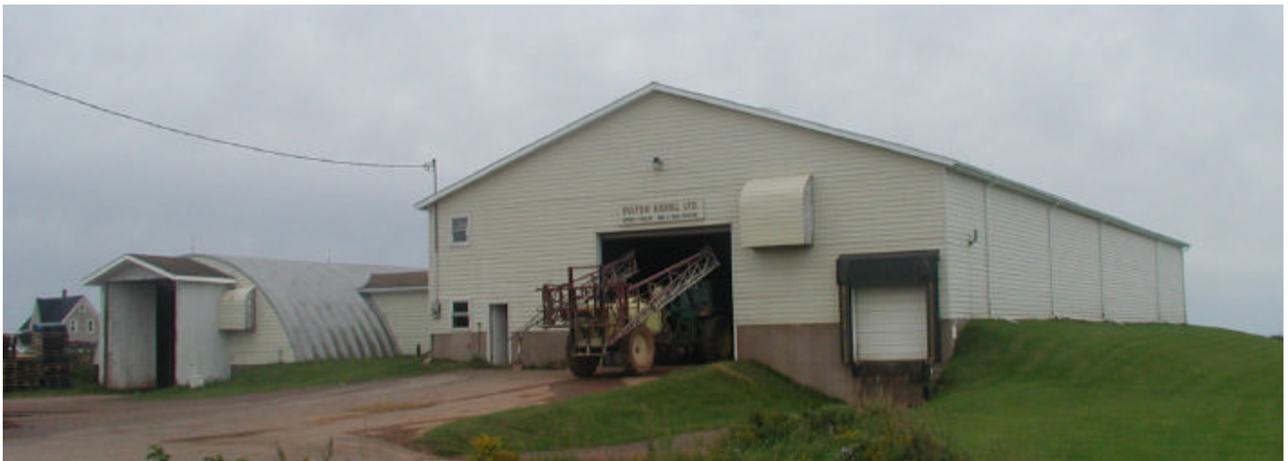
Potato barns new and old type all along the roads next to miles of fields of potatoes... seed and table