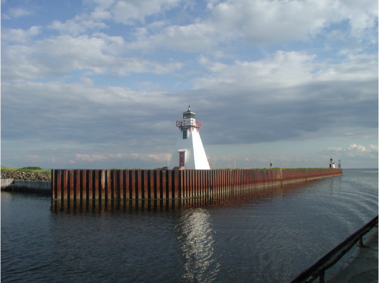
Lighthouse on PEI