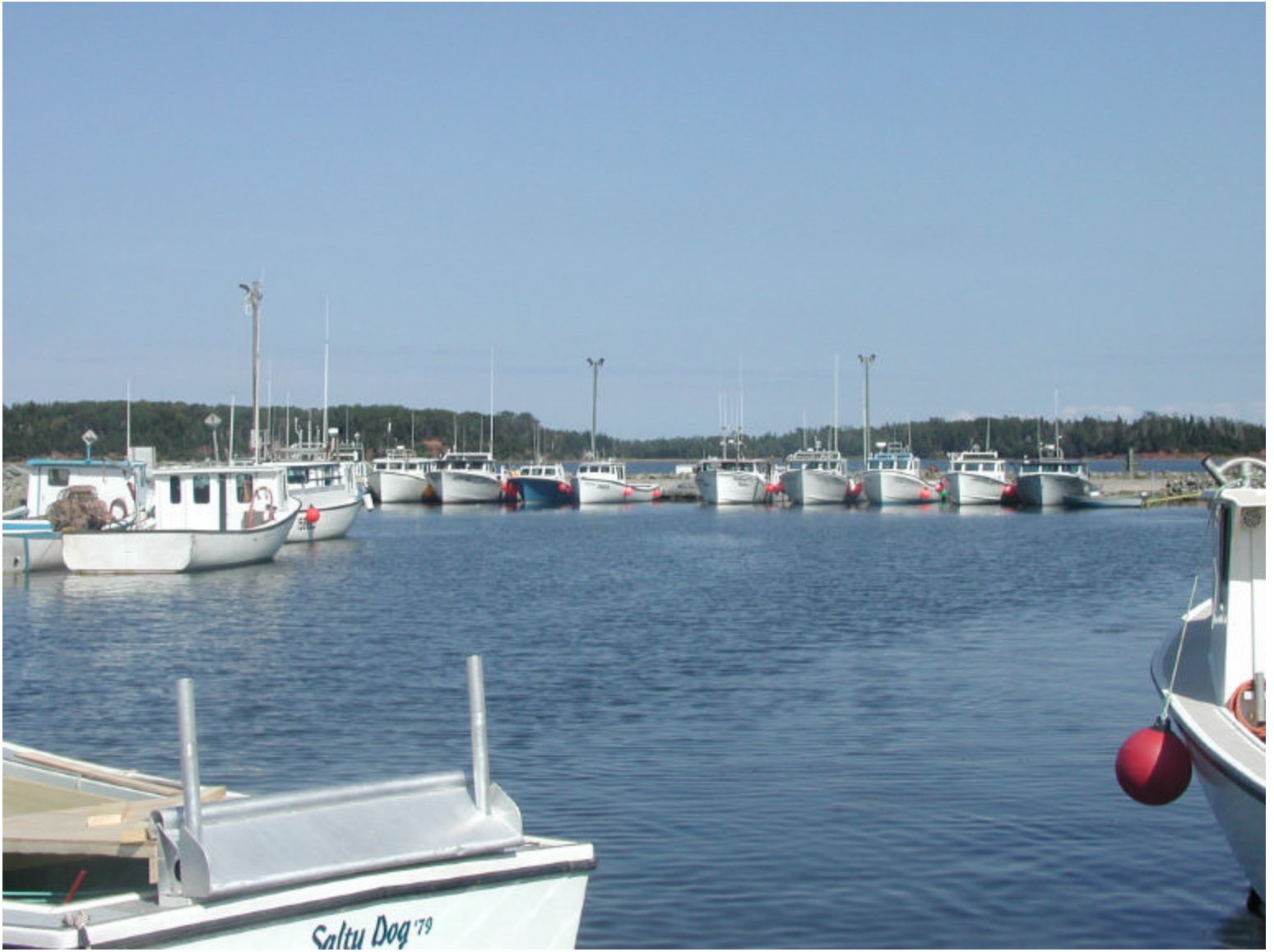
Boats at the ferry dock just bobbing in the wind.