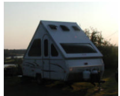
cute tent trailer all solid... no tent