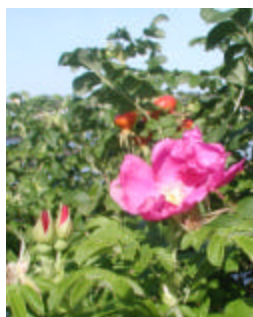
I can never resist the flowers