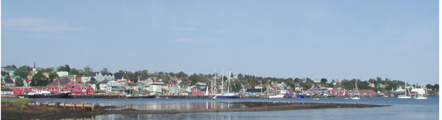
Lunenburg from across the port

We made a good supper and met a couple from outside Montreal that have one of those neat campers that look like a little "A" frame... it is really cute and lighter than ours.