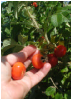
these are Rose Hips!