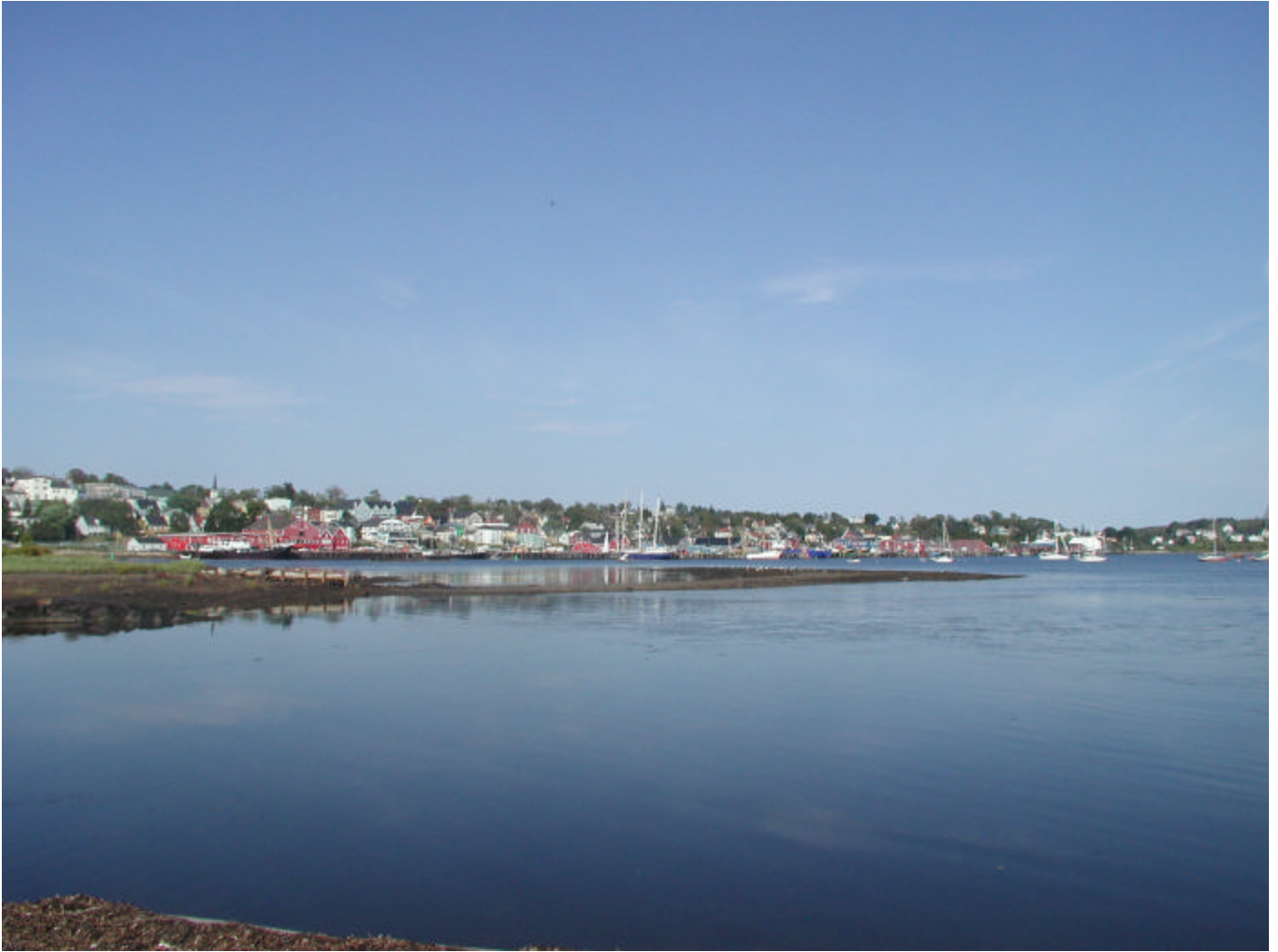
Coastal towns of Nova Scotia. You have to love it!