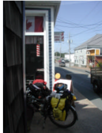
Ken's barber stop

Left down into town and across the way over rolling hills, no shoulder on Hwy 3 with bush on both sides so no views. Got to Bridgewater @ 20km 15.2/36.6 has a super store... continued on until had to go on Hwy 3 TC for some 30km to Liverpool which is a nice town with more old houses @ 66km 15.8/35.9 in 4h... there were peaks of views. Hwy 3 was not great ... shoulder the width of Ken's butt oh well the butt of his bike with panniers... 2.5 ft... only saving was it's Friday and minimal traffic. This CG is $27 with really nothing special other than another 20km to a Prov Park which may not have showers... nice showers with a inside spot to sit, laundry, firepits and picnic tables... no pool but a peak at the ocean. We cycled into a flag flapping slight wind so a little tired. Campsite filling up as this is the long weekend.... Hope we don't have any troubles tomorrow night!