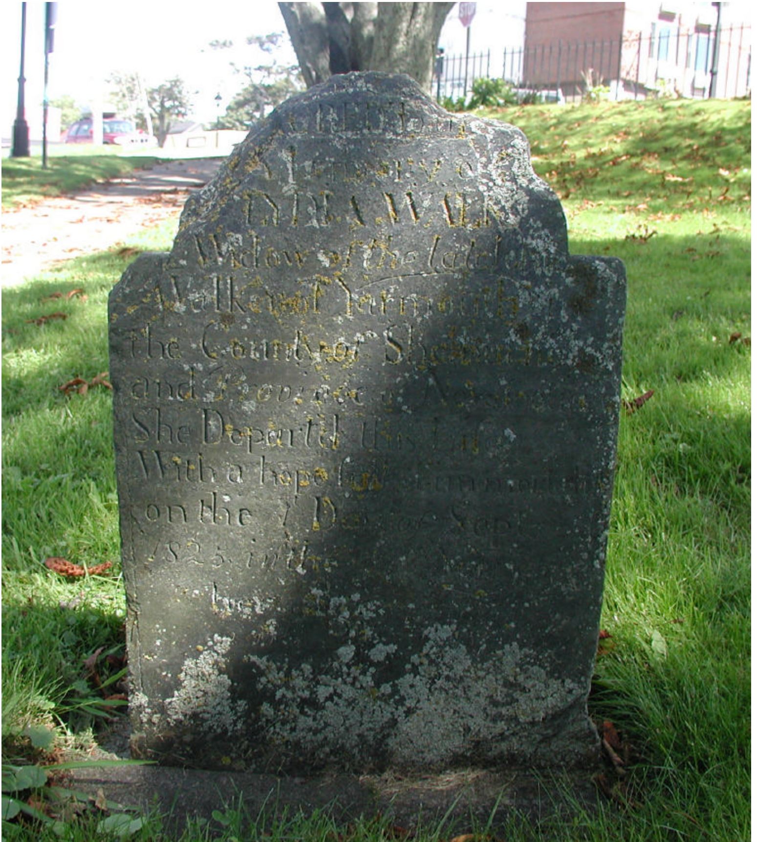
We went to Frost Park... there are old tomb stones there... they actually Tell a story on the stones